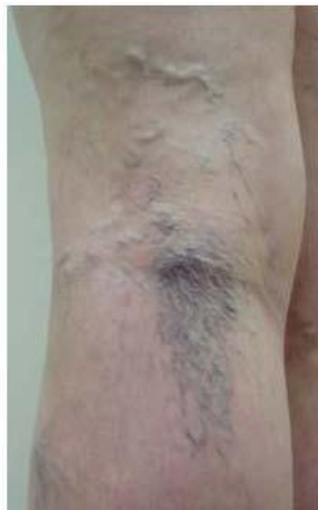
TELANGECTASIA AND RETICULAR VEINS